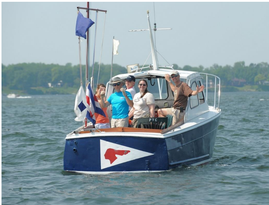
Figure 8: Race Committee Boat “Old Blue”

PYC operates a race committee boat, “Old Blue”, which can carry a crew of six comfortably and is well suited to run a race of this type (see Figure 8). Old Blue has all required flags and signaling devices. PYC additionally owns a number of skiffs used as safety boats. PYC also owns a pontoon boat used for spectators.